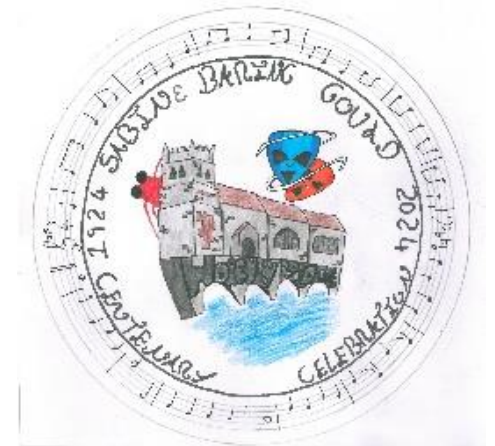
St Peter Lewtrenchard