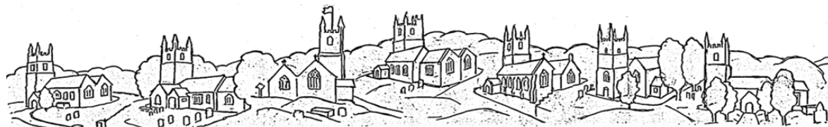
St Mary the Virgin, Kelly with Bradstone